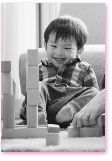
Fun for kids without leaving the comfort of your home.